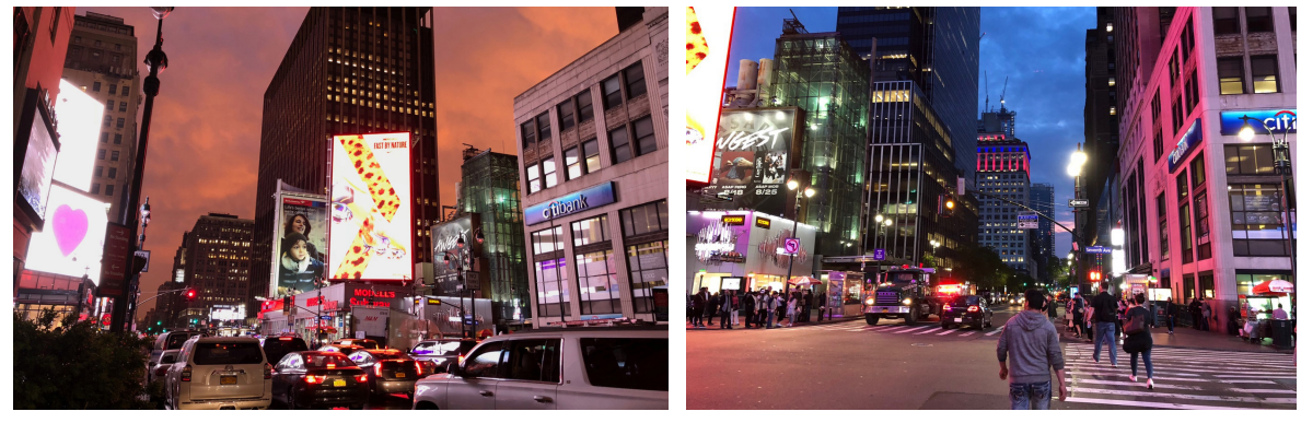
Fig. 1 New York street scenes.

context, since it presents an additional dimension in our visual world, carrying crucial information about the environment. In crowded scenes like those often encountered in busy urban environments (Fig. 1), colour enables us to detect and recognise objects fast and reliably;<sup>1</sup> it significantly enhances their saliency and is a major factor for guiding our attention.<sup>2</sup> Self-luminous colour signals can be identified quickly even from far distances and are therefore employed in road-, railway-and air-traffic. Since colour can be quickly recognised independently of visual acuity, colour signals are also important indicators for people with impaired vision.